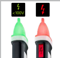
LED multicolour indicators