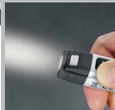
With Battery lamp